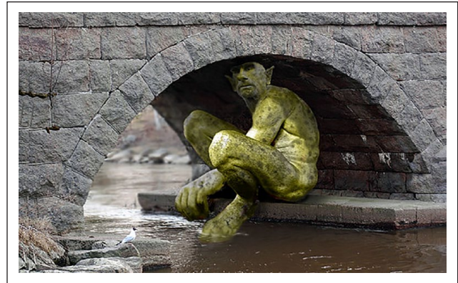
Where Trolls Belong. (Doug Wildman, Creative Commons)

Bridge/bridging ponderings provoke questions and queries about how, in the realm of fairy/folktale—especially the more sinister pre-Grimm brothers and Disney versions of such tellings—bridges act as sites of data foreboding and danger. Bridges are crossings under which trolls and other nefarious beings live, waiting to pounce. What might this folkloric trope presage about data? Might it be a reminder that encountering and attempting to cross bridges, to go beyond one’s own data territory, is a risky kind of traveling? In what ways might the trope signal an ethical data “stop!” (or at least pause) for those intending to seek their fortunes in mining data in far-flung fields?