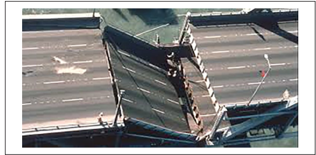
San Francisco-Oakland Bay Bridge Collapse, 1989

Another bridge collapse! Given that the modern condition is evinced by “man’s” [ sic ] mastery over nature, in what ways might this kind of catastrophic event spectralise and make manifest a broader set of anxieties relating to the failure of modernity itself? The tragedy invokes a neurotic insistence to find out what caused THIS failure, not least as a way of shoring up the idea that bridges—such modernist and monumental architectures—more generally, will continue to “work.” (Of course, such soul searching often depends on the type of bridge and where in the world such catastrophes happen.)