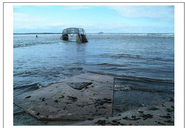
Bridge to Nowhere, Belhaven Bay